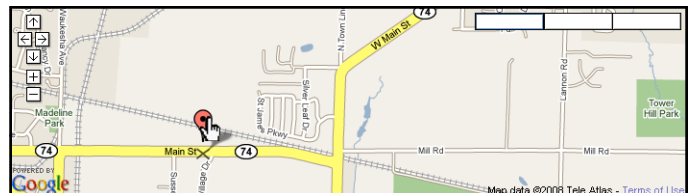
We can change the location of the map marker by dragging it to the correct location.